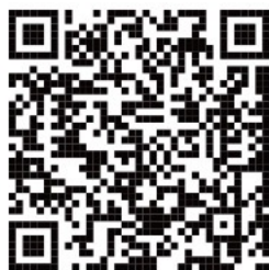
SANY Global Facebook