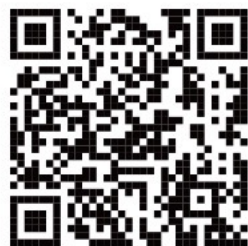
SANY Global Website

Sany Industrial park,Economic and Technological Development Zone, Changsha, Hunan, China